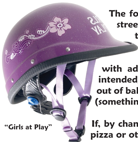
“Girls at Play”

Last fall we introduced you to our favorite “watering holes” in town. Lest you get the idea that all we do at BMO is paddle and drink, here’s a run down on other great places in Marysville to eat when a “cold, frosty one” ISN’T in order!