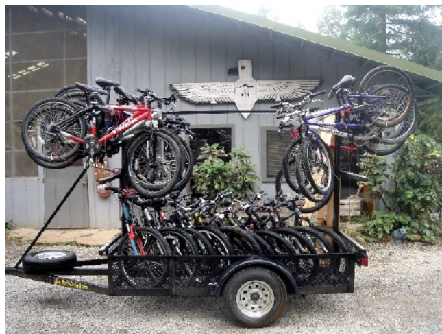
"BMO Canoe(?) Trailer"