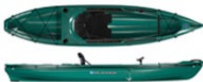
"Ultimate or Commander?"