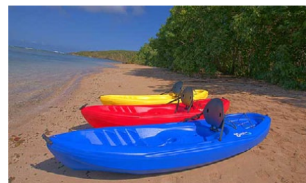
"Ripper or Spitfire?"