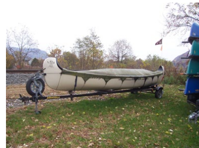
“Bloody Mary, Dry Docked”