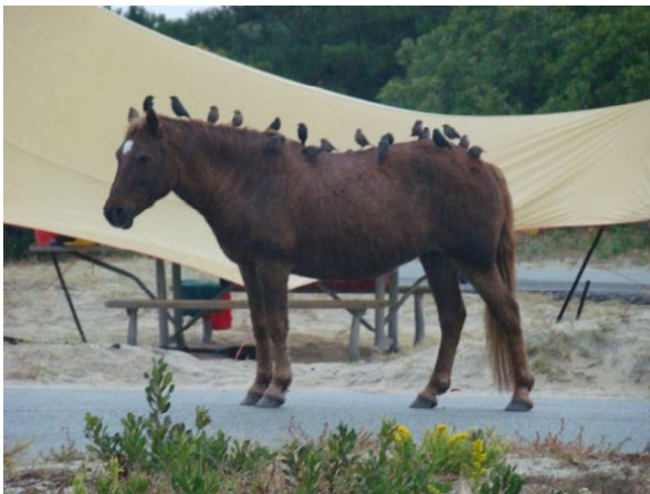
"All Aboard the Pony Express"