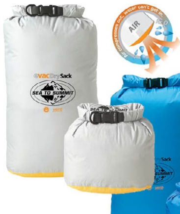
High & Dry

Often our product mix is affected by customer requests – this recently turned us on to three products that, ironically enough, were all from the same source; Sea to Summit. First was a request from a hiker who told us he had heard of an amazing waterproof stuff sack with a purging fabric bottom. Not a purge