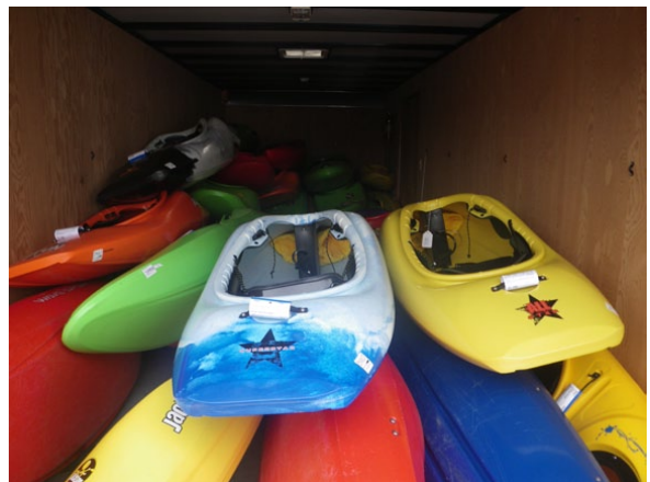
Your next WW boat just might be in here!

What beats a full house? How about a full trailer! New whitewater boats have been pouring in and we have several older ones, both new and demoed, that need good homes. Give us a call for prices and up to date inventory. (Sorry, 2010 demos are NOT for sale.)