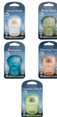
One for Each Pocket!

Thanks to the young blood here at BMO (i.e. Sarah) we now have a Face Book page. Find, friend, and/or fan us at Blue Mountain Outfitters (NOT BMO). Is Twitter next? Not if we can help it!