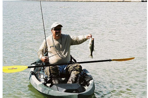
New Line, NuCanoe