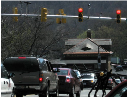
Perry County Stops Traffic