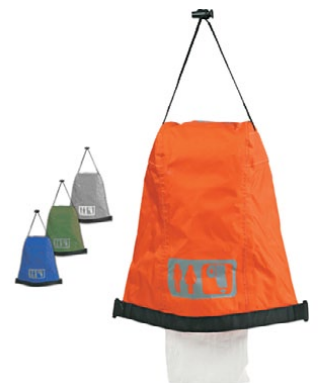
The Outhouse (of Course!)

Last, but not least, was a request from a long time customer for a toilet paper bag that keeps your TP dry and suspends it for easy dispensing. Way more compact than a coffee can, much dryer than a Zip Lock™ Bag, and even has a place to hang your trowel (they sell these also; appropriately called the iPOOD). AND if your group disagrees on whether the TP should roll off the front or back, you can always flip the bag around! No tree branch handy to hang it off? No worries; it's also designed to hang off your neck. Thanks, Karl, for the Heads (no pun intended) Up!