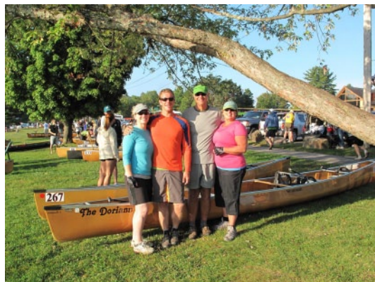
The Doriann and Her Crew