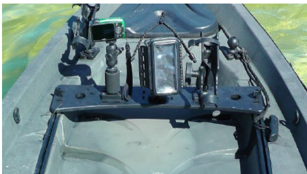
Slide Mount, All Pimped Out!