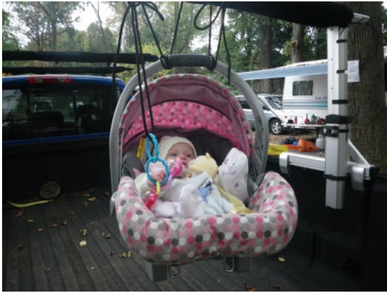
Gracie in Doug's Labatt Blue Baby Swing