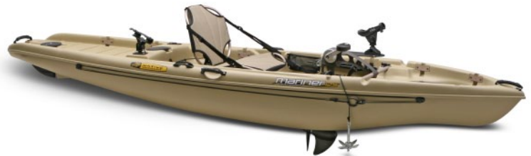
Native Watercraft Mariner Volt (ours is actually cameo.)