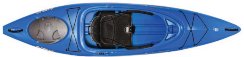
Wilderness Systems Aspire

Wilderness Systems is expanding their recreational line with the Aspire 100 & 105, with drop down skeg. Redesigned this year is the Pamlico 145. Not so sure we're excited about this one (we REALLY liked the original) but are sure there will be fans of the extra capacity and stability. (How's that for diplomatic writing!) On the positive side, the redesigned Ride 115 and 135 Advance Seating System, featuring a 4" higher seating position, is sure to be a hit. AND, Wilderness is offering a seat upgrade kit so 2012 Ride owners can enjoy the new seat at a nominal cost without having to buy a new boat. All other Wilderness Systems seats are being upgraded as well. (We were afraid "Phase 3" was being replaced with "Phase 4" [where does it end?] but instead it's "Phase 3® AirPro", more comfort, better ventilation, and easier to adjust.)