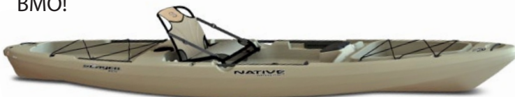
Native Watercraft Slayer

Native Watercraft is expanding their already successful fishing line this year with the 12' and 14.5' Slayer, featuring Legacy's signature tag-a-long wheel, and new High Low seat. Coming soon to BMO!