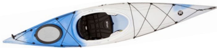
Perception Expression 11.5

Perception adds to their popular Expression "family" an 11-1/2' sibling, the Expression 11.5; all the pluses of the Expression line in a more compact model.