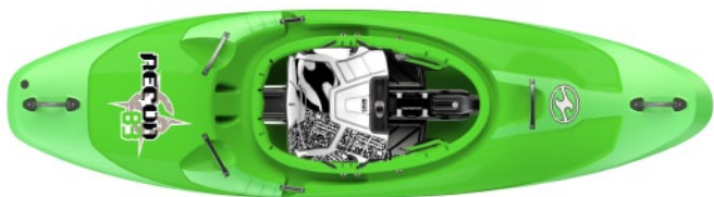
Wave Sport Recon