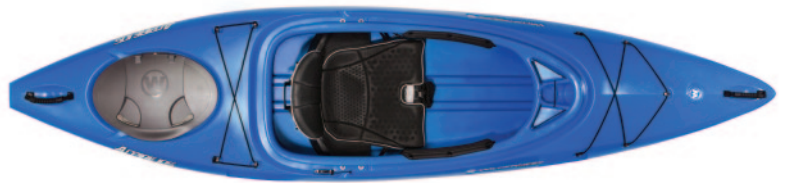
Wilderness Systems Aspire

Wilderness Systems is expanding their recreational line with the Aspire 100 & 105, with drop down skeg. Redesigned this year is the Pamlico 145. Not so sure we're excited about this one (we REALLY liked the original) but are sure there will be fans of the extra capacity and stability. (How's that for diplomatic writing!) On the positive side, the redesigned Ride 115 and 135 Advance Seating System, featuring a 4" higher seating position, is sure to be a hit. AND, Wilderness is offering a seat upgrade kit so 2012 Ride owners can enjoy the new seat at a nominal cost without having to buy a new boat. All other Wilderness Systems seats are being upgraded as well. (We were afraid "Phase 3" was being replaced with "Phase 4" [where does it end?] but instead it's "Phase 3® AirPro", more comfort, better ventilation, and easier to adjust.)