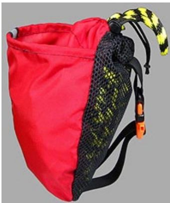
North Water 4-Bailer

Sometimes we feel rules and regs in the Good Ol' USA are a bit over the top, but our Canadian neighbors top out even higher. In addition to the regs that affect us, non-powered boats in Canada must carry a bailer (can be a simple plastic jug cut down), a buoyant 15 meter heaving line (aka throw rope), and, (if freeboard is less than .5 meters, which covers most all our canoes, kayaks, and paddleboards), a re-boarding device. North Water (of Canada, of course) has addressed several of these requirements with a couple new, and very affordable, products. The 4-Bailer is a 50' (5 meter) throw rope, bailing bucket, and whistle, all in a compact $29.95 package. Also new is the StepUp Stirrup, $12.95, which meets the re-boarding device requirement. The good news is, your PFD qualifies as long as it meets your country's requirements. (And contrary to what we've been told by some of our customers in the past, Canada does NOT require that the PFD be Red, Yellow, or Orange; they merely suggest that it's a good idea.) SO, now you know what you need to venture into the Great North Country!