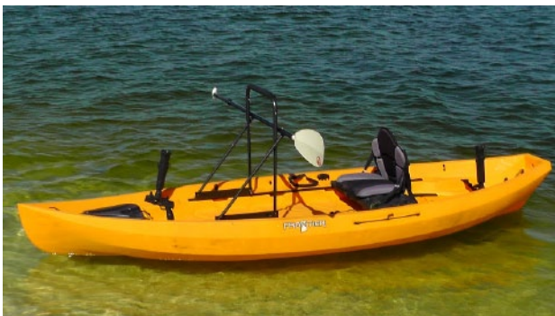
Frontier Casting Bar

NuCanoe is ramping up production to meet demand for the Frontier 12, which exceeded expectations in 2012. The seating system has been improved this year, and NuCanoe is offering an upgrade kit to all 2012 Frontier owners at a bargain rate of $50 to upgrade both seats. Order through any NuCanoe dealer, but hurry...after November 30th the cost goes up 55%! Also new this year, the Casting Bar and Slide Mount, pictured below, and the Transformer Paddle (It's a Kayak Paddle; no, it's a SUP Paddle; no, it's a Stakeout Pole; NO, it's a Push Pole!)