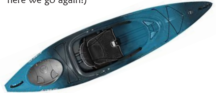
Wilderness Systems "Midnight"

Moody Blues? Wilderness Systems "Indigo" (Touring) or "Midnight" (Recreational; here we go again!)