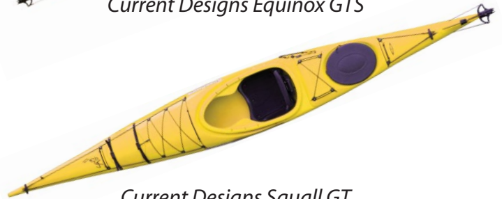
Current Designs Squall GT

The Current Designs Vision series has also expanded, to include a choice of rudder or skeg on the 140 and 150, and skeg on the 130.