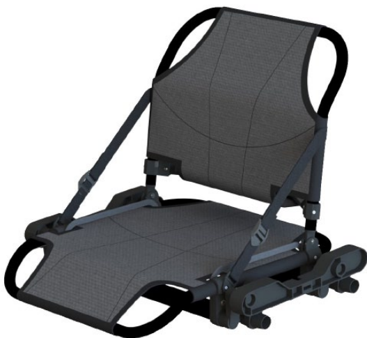
Wilderness Systems Ride AirPro Max Seat

Improving the popular Ride series is difficult, but Wilderness Systems upped the ante this year with the AirPro Max seat. Durable, breathable, and VERY adjustable!