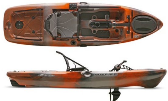
Native Watercraft Slayer 10 Propel

Native Watercraft expanded their Slayer Propel line to include a pickup-truck-friendly size 10' model. (Wish we'd seen it in the regular Slayer as well; hopefully later!)