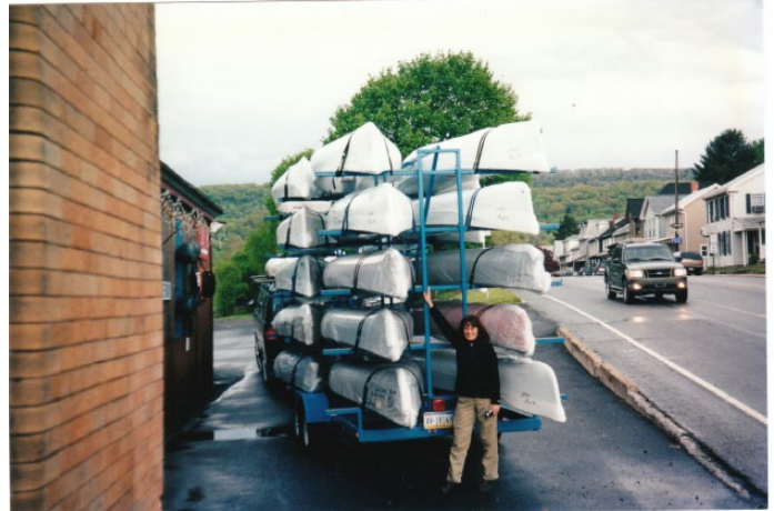
Tall Canoe Trailer