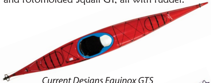
Current Designs Equinox GTS

Current Designs is expanding their North American touring kayak line this year to include the composite Equinox GTS and GT (both 16'), and rotomolded Squall GT, all with rudder.