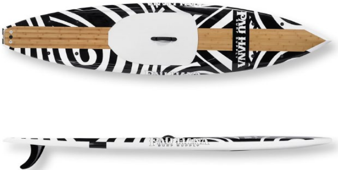
Pau Hana Mlnisport

Also new for 2015 at BMO are Pau Hana and Malibu stand up paddleboards. Our rep had us interested as soon as we saw them, then we were TOTALLY hooked when we found out that "Pau Hana" is Hawaiian for "Work is Over". That says it all!