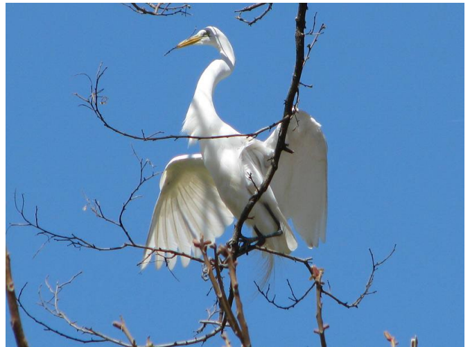
Great Egret at Wade Island Rookery