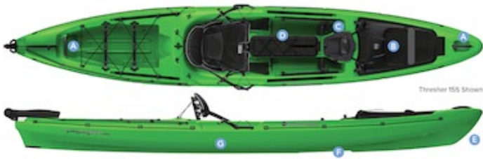
Wilderness Systems Thresher 140

Wilderness Systems continues to expand their sit on top fishing line with the Thresher 140 and 155. While mainly targeted to offshore anglers, we see an application for the 140 on our larger local rivers and lakes. Will have one here soon; stop by and check it out!