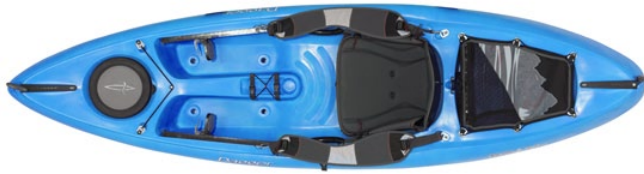
Dagger Roam 9.5

bringing us the Roam, in both 9'4" and 11'5" lengths (unlike the Coupe, which only came in 10') Sit on top crossover performance with drop skeg, thigh straps (nope, you don't have to buy them separately!) and improved storage. We think they've got us covered!