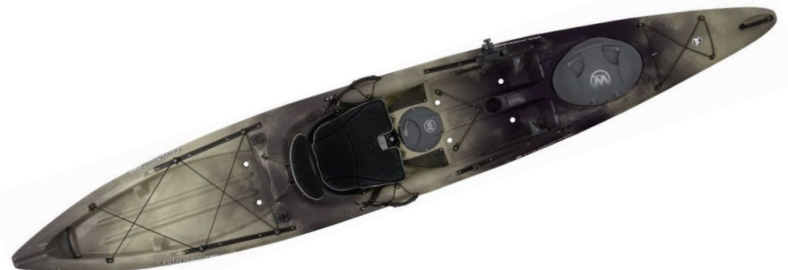
Wilderness Systems "Flint" (the latest of 3 different camo's!)

Camo? Take your pick! Never KNEW there could be so many choices!