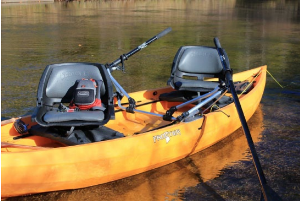
NuCanoe Frontier Rowing Rig

NuCanoe Frontier owners have been asking, and NuCanoe has delivered. We now have a rowing rig to fit the NuCanoe Frontier; available at (drum roll...) you guessed it, BMO.