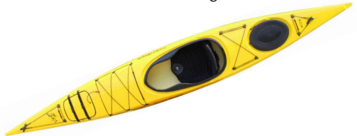
Current Designs Vision 140

The Current Designs Vision series has also expanded, to include a choice of rudder or skeg on the 140 and 150, and skeg on the 130.