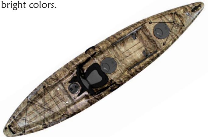
Wilderness Systems Tarpon 120 UL

Also returning to Wilderness Systems (with a twist), ultralight versions of the Pungo 120 and Tarpon 120. The twist? Both will be available in stealthy Realtree AP® Camo, as well as three bright colors.