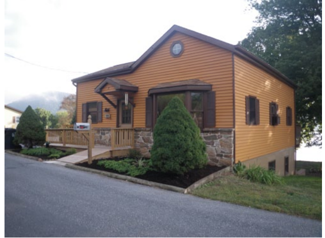
Susquehanna River Cottage

much time, and WAY too much cussing later) it's ready to rent out short term to paddlers, fishermen, and anyone who just wants to spend some time by the water. Check it out on http://www.VRBO.com , property ID 620568. (But if you're interested in staying there, better hurry; it's booking up fast!)