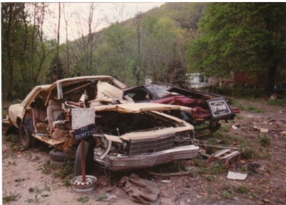
Is that really a "No Dumping" sign?

Photo taken along Shermans Creek, circa 1995...talk about irony!