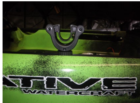
Native Watercraft Cam-Lok Paddle Holder

Once in awhile someone comes up with an idea that's one of those "smack me on the head, why didn't I think of that?" things. Native Watercraft's track mount paddle holder is one of those things. The problem is, it only fit their tracks. (Well, maybe not a problem for them!) We took turns fussing with it, trying this and that, and finally came up with a way to make it work on NuCanoe and Wilderness Systems tracks, and more than likely on many others as well. Where there's a will, there's a way!