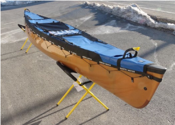
North Water Canoe Cover, Ready for Northern Water Adventure!

Too often in our industry (as well as many others we're guessing) it becomes all too easy to say "Sorry, can't do that" instead of "Let's see how we can do that". We were fortunate to experience a great case of the latter in working with North Water Design this spring. One of our customers who does a lot of remote, solo wilderness canoe trips (the kind where the float plane takes off, and everything had BETTER work) mentioned that he was waiting for a custom cover for one of his canoes, but it wasn't progressing as fast as he had hoped. We asked him to consider a North Water canoe cover instead. He actually had two canoes he needed covers for, but obviously could only paddle one at a time. One interchangeable cover would be ideal. The glitch? There was a 3" width and 10" length difference between the two boats. Rather than taking the easy way out and telling him he needed two covers, North Water went to the drawing board and designed an adjustable cover that snugly fit both canoes. Our customer was happy, and we are happy to commend North Water for going the extra distance!