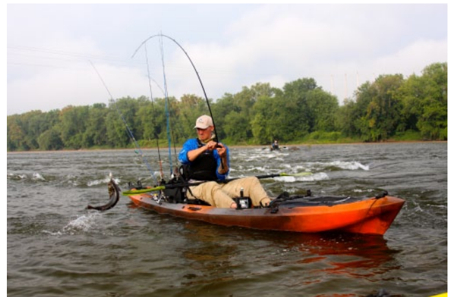
Wilderness Systems ATAK

Wilderness Systems is also expanding their fishing line this year to include the ATAK, a 14' long sit on top designed from stem to stern for catching fish, and being comfortable while doing so. Also coming soon to BMO