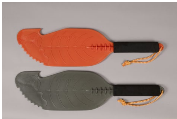
Assault Hand Paddle

(First ATAK and then Assault...sounds like things are getting a bit brutal around here!)