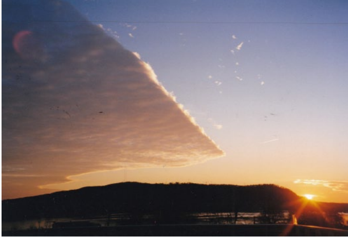
Storm Cloud from BMO Deck (Check out the "eye" of the storm!)